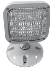
Single lamp with Weatherproof (WP) Option