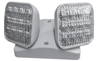
Double lamp with No Options